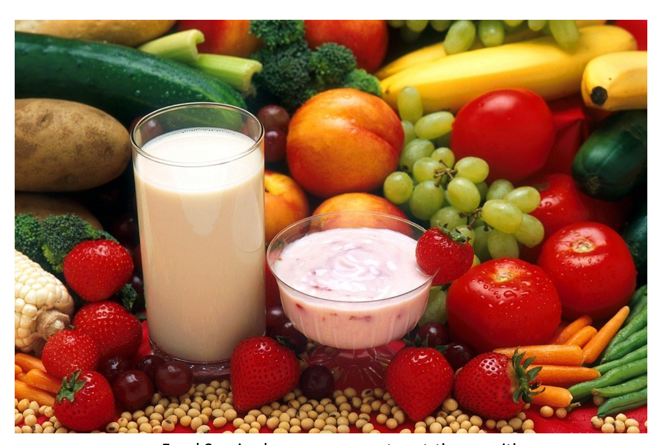
Food Service has a permanent part-time position open