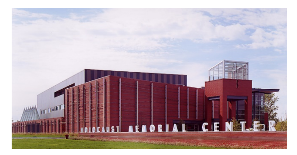
Holocaust Memorial Center