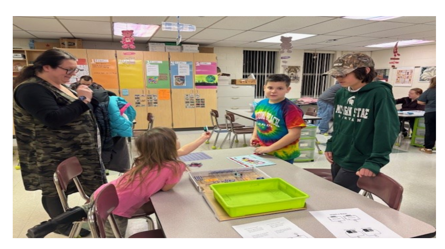
Lottie M. Schmidt Elementary School is considered a Title I building. This federal classification provides additional funding and programs to benefit our students.