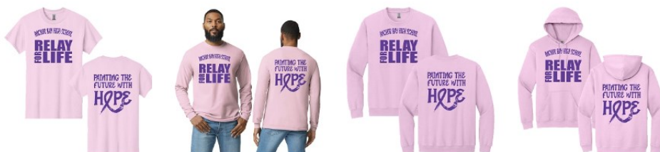
ABHS Relay For Life T-Shirt $13

Also the Relay for Life team is ordering team shirts. If you would like to order one, please do so by Oct 31 . You do not need to have it shipped to your house. There is a option to have it picked up by coach. I will get the shirts and deliver them to you. I do not know when they will be completed.